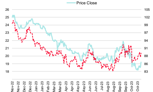
Charoen Pokphand Foods (CPF TB)